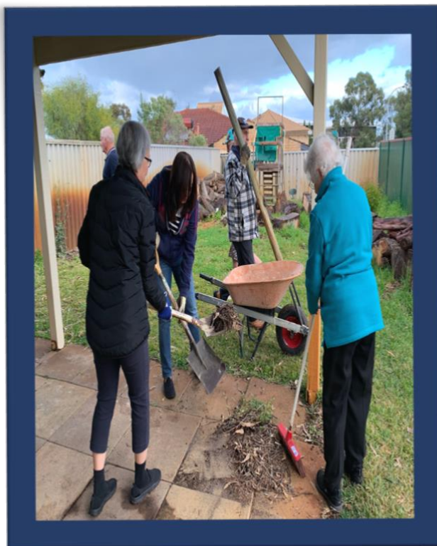
JULY 2020 BUSY BEE

I invite each one of us to pray fervently for God's blessing on this Parish project, as we seek to respond to Christ who lives in the vulnerable and suffering in a special way. Thank you and God bless each one of you.