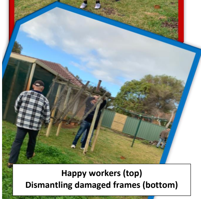
Happy workers (top) Dismantling damaged frames (bottom)